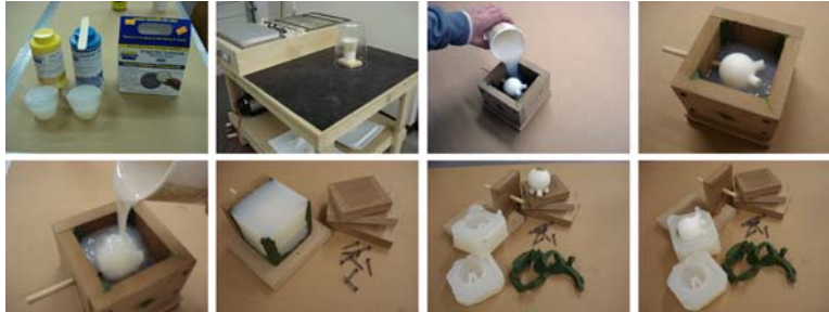
Figure 4: Mold making and casting process

Once the mother mold was developed the researchers casted a crystal clear resin mixture in order to simulate manufacturing process. The resin connection joints are very strong and hold the same precision as the 3d printed parts, making it easy to use the same plastic extruded tubes as the linear connections between the connection joints. It is a workflow that is ultimately influenced by the parametric modelling and its ability to develop models that have the precision need to fabricate such structures.