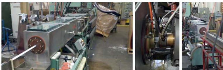
Figure 3: Plastic extrusion process

Plastic extrusion was utilized in the project as a means to mass manufacture tubes which can act as the spanning lengths between connection joints (figure 3). Plastic extrusion takes raw material into a hopper for drying. Once the material is dry, it is then released into the extruder and pushed through a heated cylinder by a steel screw. The temperature is digitally controlled in order to maintain a constant viscosity of the plastic. At the end of the screw, the material is forced through a die that is within thousands of an inch to the desired profile. The die controls the wall thickness, scale, and tolerances of the final product. The plastic then runs through a vacuum tank where the tube is blown to the proper outer diameter while keeping a constant wall thickness. The vacuum also cools material down and allows the form to hold its shape as it continues down the production line. At the end of the production line the material is cut into a respective length.