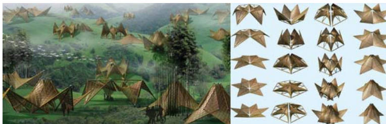
Figure 5: Temporary shelter using connection joint and industrial manufacturing

Parametric modeling has shown to have substantial benefits when used as a design and production drawing generator for digital fabrication. One benefit is that the designer has the ability to experiment with numerous design and tooling possibilities. Parametric modeling can also produce material take-offs and cutting diagrams for production, CNC tool-paths, assembly labels, and stereolithograph files used in three dimensional printing. This project shows how a parametric model was not only used to generate forms but also used as a tool to assist the pre-making processes needed for fabrication.