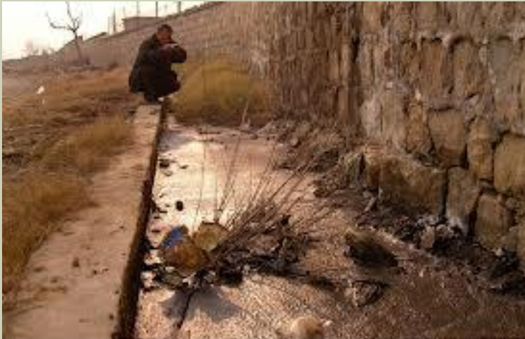
"The Warriors of Quigang" (2012) Directed by Billy Tang. Produced by Toposcreen.